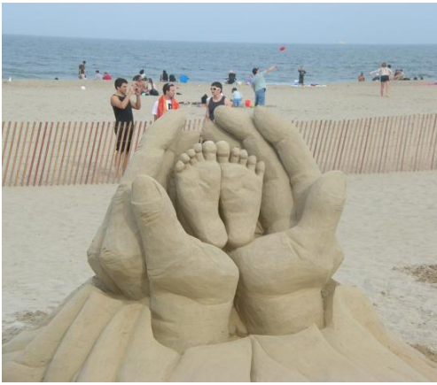
Precious Feet at Hampton Beach Sand Sculpture Contest, June 2011